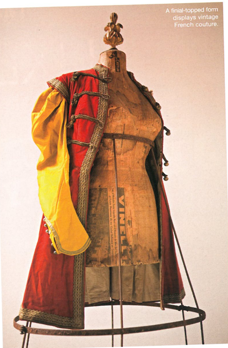
A finial-topped form displays vintage French couture.

OPEN JUST A YEAR , Adesso has become a lure for top-tier designers across the country. Style-makers seeking that elusive one-off piece for a demanding, discerning client know their salvation lies in Adesso, which offers a well-edited, eclectic, and worldly collection.