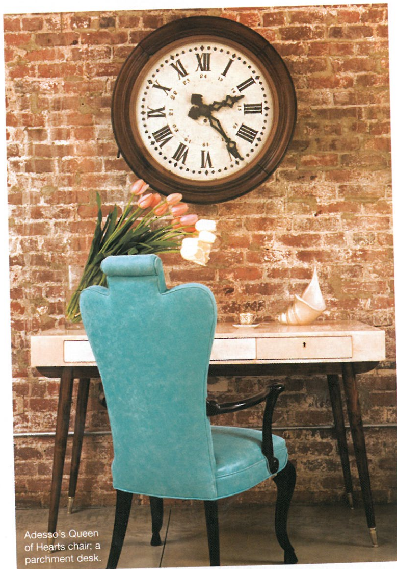
Adesso's Queen of Hearts chair; a parchment desk.

If it's one-of-a-kind finds you're after, hop over to Pasadena for an elegant afternoon of treasure hunting at Adesso.